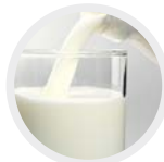
milk / hydrolyzed milk protein