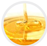
honey / mel

Each active ingredient is selected for its specific action and lasting effect, for weightless hair with maximum vitality and shine.