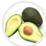
avocado / persea gratissima