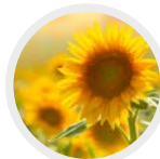
sunflower / helianthus annuus