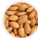
almond / prunus amygdalus dulcis