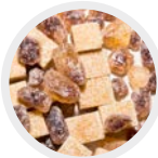
sugar cane / saccharum officinarum