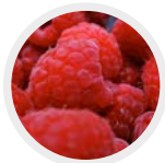
raspberry / rubus idaeus