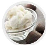
shea butter / butyrospermum parkii