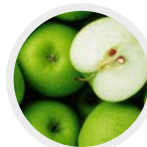
apple / pyrus malus