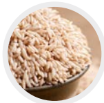
rice / oryza sativa