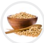
soy / soy amino acids