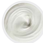
yogurt / yogurt powder