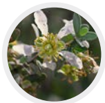
jobba / simmondsia chinensis