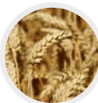
wheat / wheat amino acids