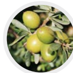
argan / argania spinosa