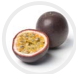
maracuja / passiflora edulis