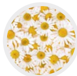
camomile / chamomilla recutita

Amino acid complex — Soy and wheat derived amino acid complex (Fision KeraVeg18).