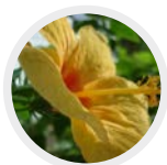
hibiscus / hibiscus sabdariffa