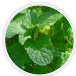
mint / mentha piperita