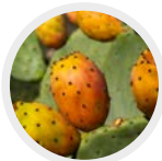
prickly pear / opuntia ficus indica

Our commitment is to use organic ingredients of natural origin wherever possible without compromising the quality of the formulas or the results.