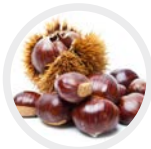
chestnut / hydrolyzed chestnut