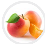
apricot / prunus armeniaca