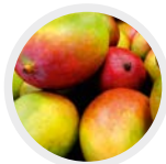
mango / mangifera indica