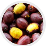
buri / mauritia flexuosa