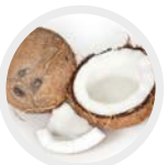
coconut / cocos nucifera