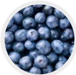
blueberry / vaccinium myrtillus