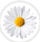
daisy / bellis perennis