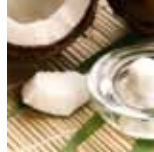
Coconut Cocos nucifera