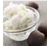
Shea butter Butyrospermum parkii