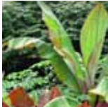
Abyssinian Brassica abyssinian

Our challenge is to use natural and organic ingredients without compromising quality and excellence. Each active ingredient is carefully selected for its long-lasting effect on the hair's health and appearance, leaving it manageable, vibrant and radiant.