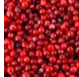
Cranberry Vaccinium oxycoccos