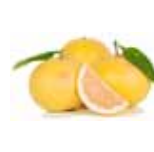
Grapefruit Citrus x paradise