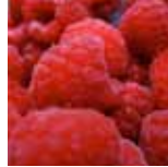
Raspberry Rubus idaeus