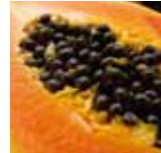
Papaya Carica papaya