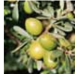
Argan Argania spinosa