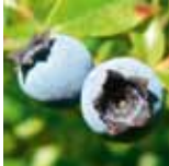
Blackcurrant Ribes nigrum