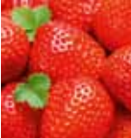
Strawberry Fragaria ananassa