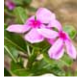
Rose myrtle Rhodomyrtus tomentosa