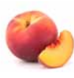
Peach Prunus persica