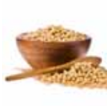
Soya Glycine max