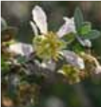
Jojoba Simmondsia chinensis