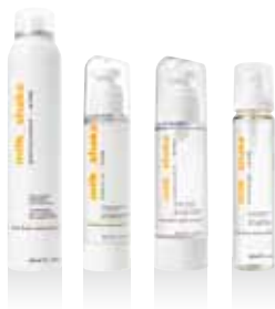
milk_shake® no frizz