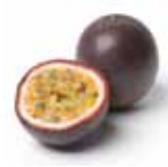
Passion Fruit Passiflora edulis