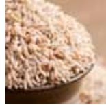
Rice Oryza sativa