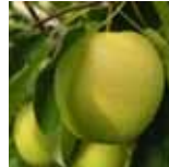
Apple Malus domestica