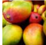
Mango Mangifera indica