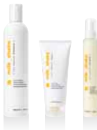
milk_shake® curl passion