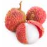
Lychee Litchi chinensis