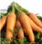
Carrot Daucus carota