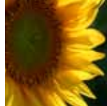
Sunflower Helianthus annuus