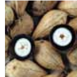
Muru muru Astrocaryum muru-muru